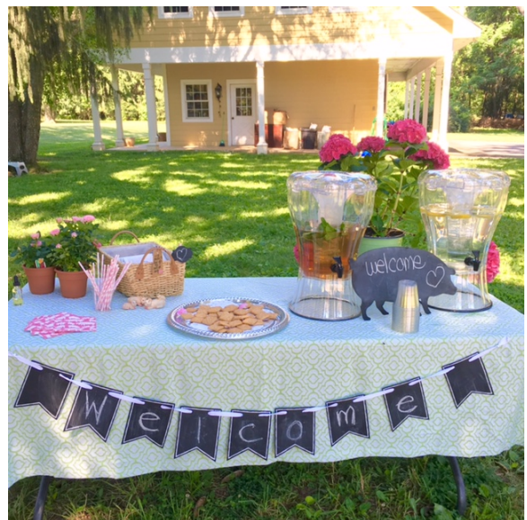
Tranquil Space Yoga and the Animals Event