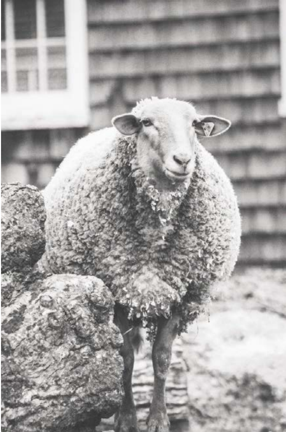
Honey