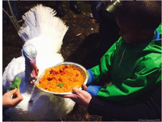
Celebration for the Turkeys