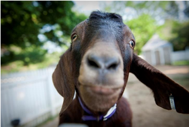
Mac the Goat

BMASER feels blessed to have so many outstanding volunteers to foster our mission. So many adults and children alike have supported BMASER in many ways, from manual farm labor to staffing for events. We are grateful for all of the volunteers who helped with our exhibition events, farm tours, and provided food for our events.